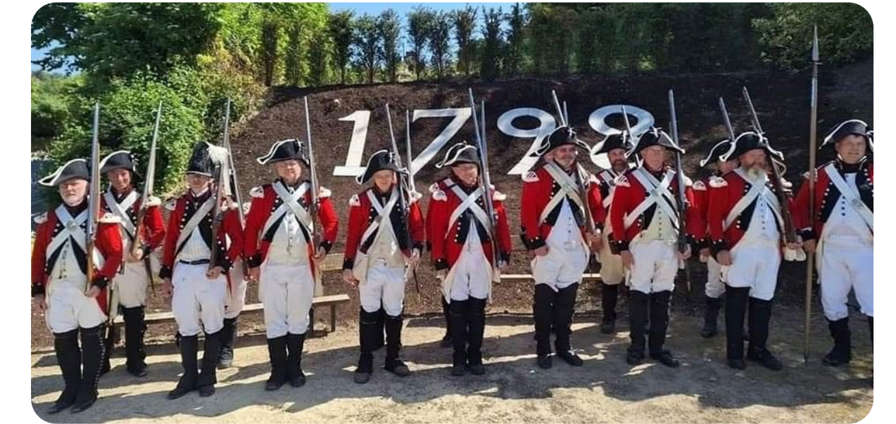
c) Newtownmountkenedy Tidy Towns hosted a Festival of Remembrance for the 225th Anniversary of the 1798 Rebellion on Sunday 28th of May supported by Codling Wind Park.