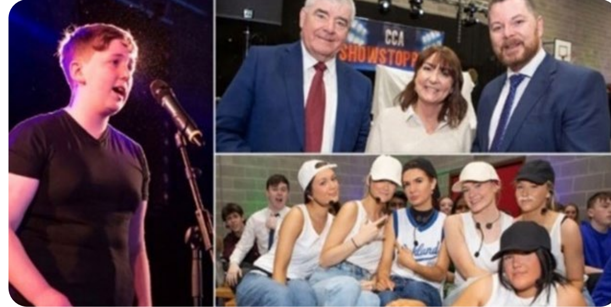
a) We had the pleasure of sponsoring and attending the Coláiste Chraobh Abhann Showstoppers Concert in Kilcoole, Co. Wicklow in February. Well done to all the students for organising this hugely successful sell-out show.

Codling Wind Park is committed to supporting local communities and enabling them to share the benefits of offshore wind energy. It's really important to us, that our neighbours benefit from the opportunities renewable energy brings, and we do our best to facilitate that locally. Here's a selection of some of the local events we have recently supported. If your event, club, or charity would benefit from Codling Wind Park sponsorship, please go to our website to complete the sponsorship form.