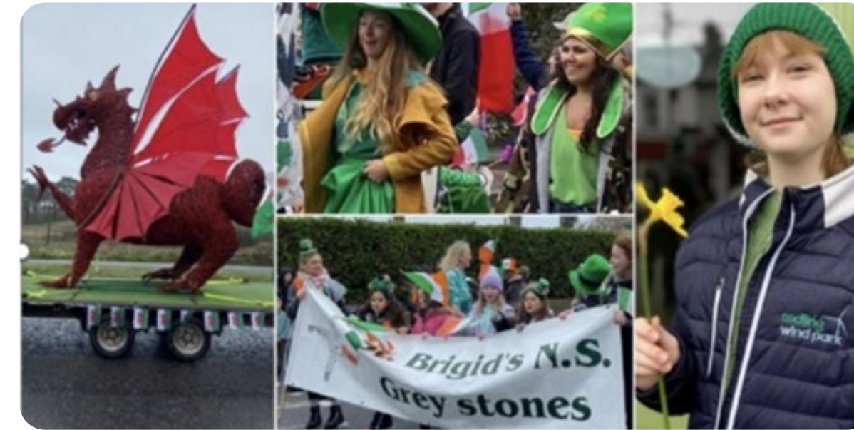
b) After a 3-year hiatus, the Greystones St. Patrick's Day Parade, supported by Codling Wind Park made a very welcome return on the 17th of March.